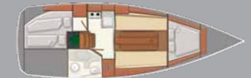
Interior 2-cabins inboard engine