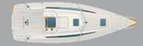
Decklayout with tiller