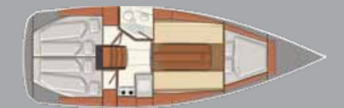
Interior 3-cabins outboard engine