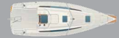
Decklayout with steering wheel