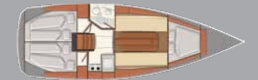
Interior 3-cabins outboard engine